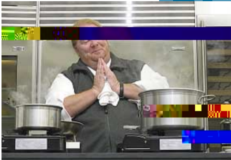
Iron Chef Mario Batali.